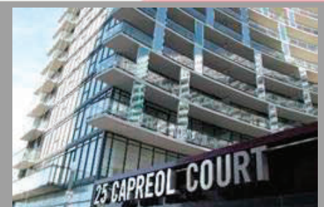
$429,900 Fabulous Downtown City place Condo! Lots Of Natural Light. Beautiful North View! 24 Hr Concierge, Fiber Optic Internet. Close To Union Station & Supermarket. Approximately 823 Sq ft.