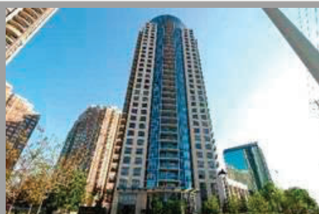
$269,900 Tridel Built Ultra Ovation. Close to Square One, hwy and Go Transit. 24 Hr Concierge, Swimming Pool, Fantastic Clear South View Of The City & Lake, Great Lay Out 1 Bedroom + Den.