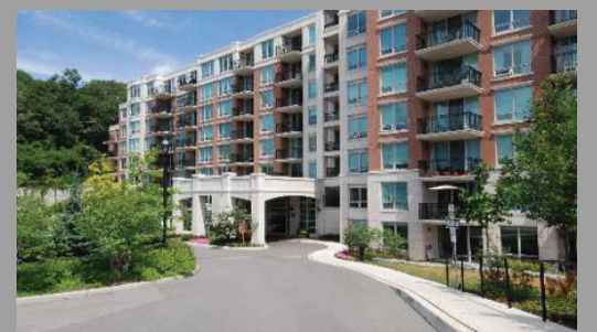
$339,000 York Mills. Apprx 750 SF. Ravine setting. One bedroom + Den, Den can be another Bedroom. Club house with full facilities. 24 hours concierge. Immediately possession. Don't miss this one.