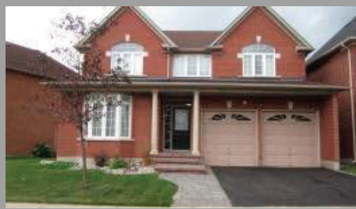
$879,500 Spacious House In Desirable Westmount. Open Concept, 9' Ceiling, Fully Finished Basement. Butler's Servery. Walk-In Closets In Master & 2nd Br. Hw Floors, Oak Stairs, Fireplace, New Elf's and more!