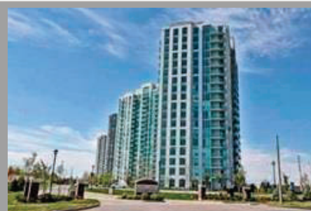
$275,000 Brand New Luxurious Papillion Place. Granite Countertop, Unobstructed View. Wood Floor In Living, Dining and bedroom. Large Balcony. Close To Erin Mills Town Centre and Hwy. Indoor Pool.