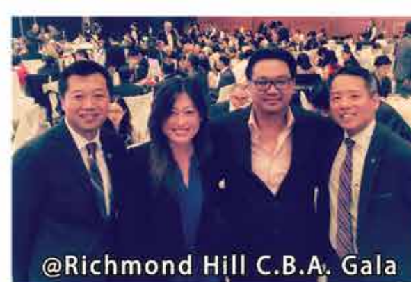
@Richmond Hill C.B.A. Gala