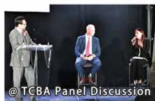
@TCBA Panel Discussion