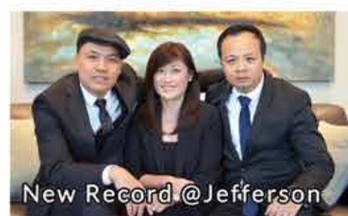
New Record @Jefferson