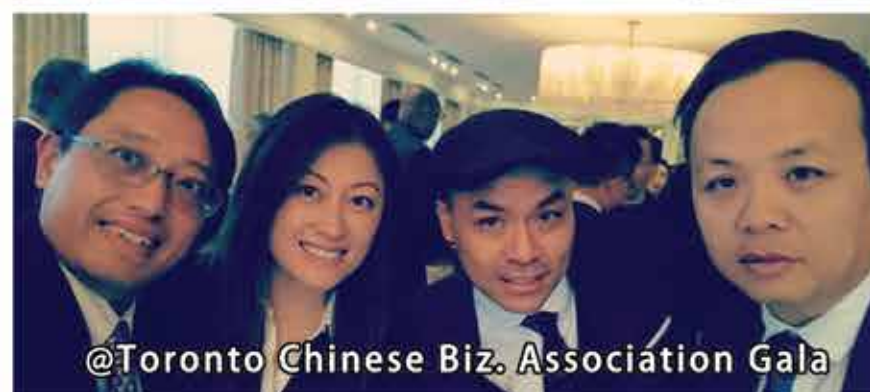
@Toronto Chinese Biz. Association Gala