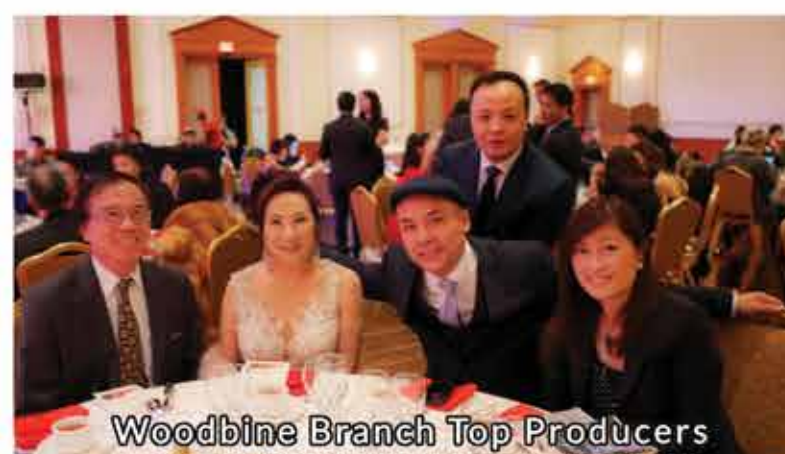
Woodbine Branch Top Producers