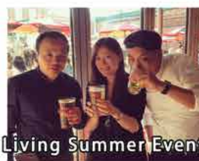
Living Summer Event