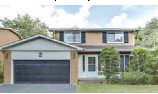
North York 4 BR For Lease $3000