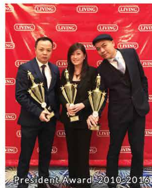
President Award 2010-2016

Looking for Real Estate Agents who Represent You Wholeheartedly?