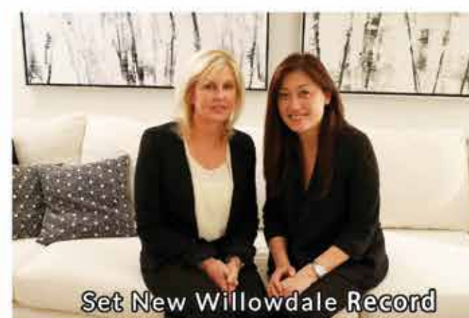
Set New Willowdale Record