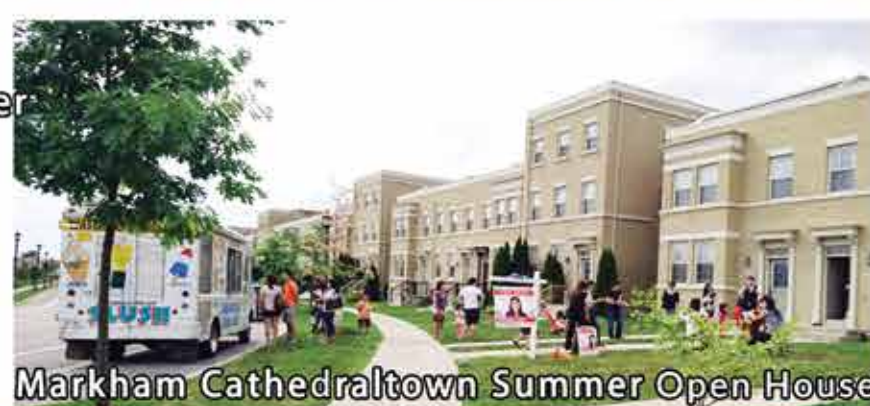
Markham Cathedraltown Summer Open House