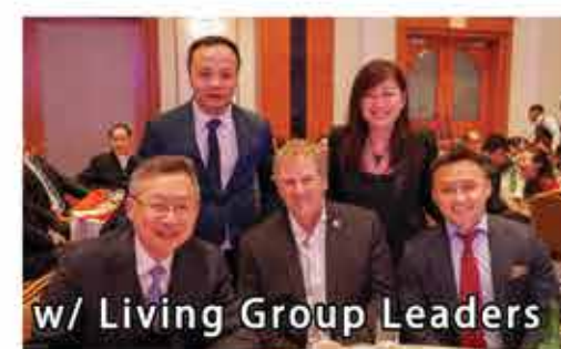
w/ Living Group Leaders