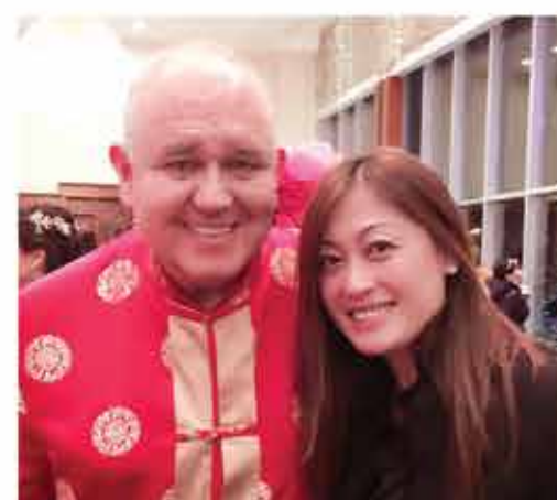
@Markham Mayor CNY Dinner

Thanks for your Support in 2016! Wish All a 2017 of Health & Wealth!