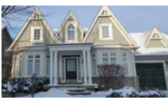
Exclusive@Angus Glen, Markham 4BR $2.5m / $1.2m