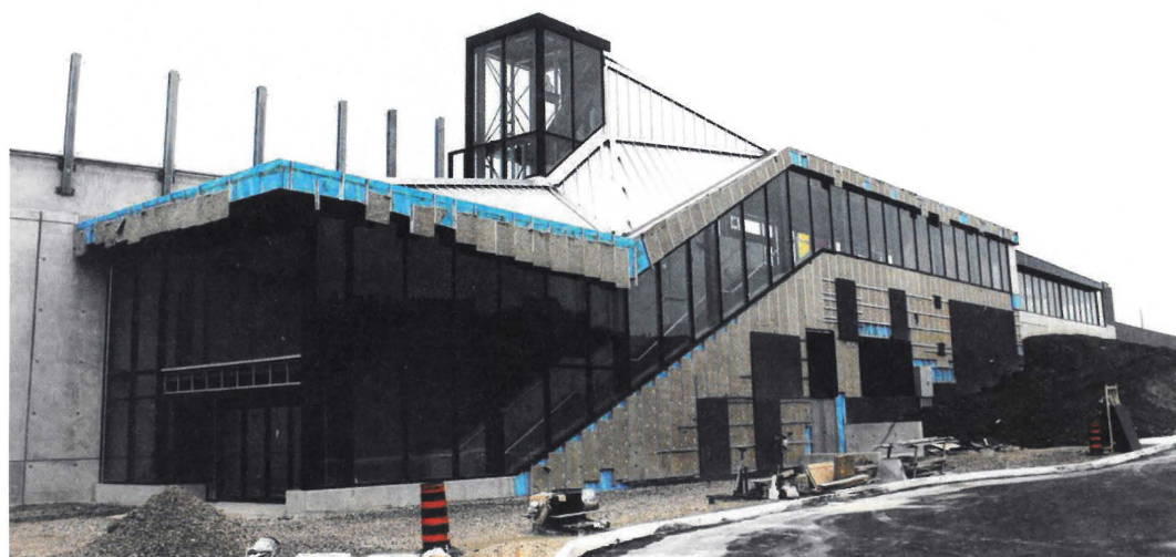
Construction underway on the Central Parkway Station, one of four Transitway stations scheduled to open in early 2014

MISSISSAUGA – Over the past year or so, Mississauga residents may have noticed quite a bit of construction activity along Highway 403, as crews work to complete a new set of bus transit roadways and stations from east to west in the heart of the city.