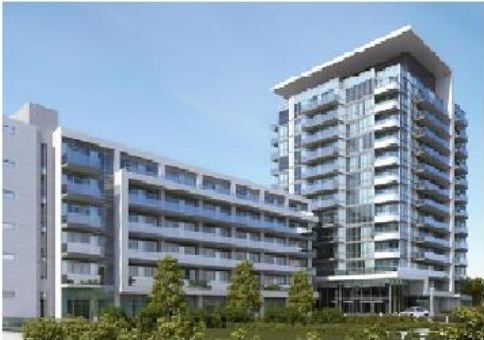
The Colours of Emerald City is a new condo development by Elad Canada currently in preconstruction at Sheppard Avenue East & Don Mills Road in Toronto. The development is scheduled for completion in 2017. Sales for available units start in the mid $200,000's.