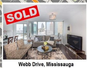
Webb Drive, Mississauga