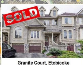
Granite Court, Etobicoke