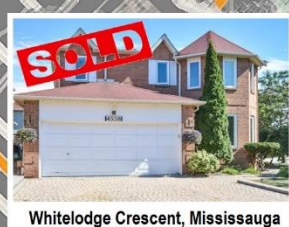
Whitelodge Crescent, Mississauga