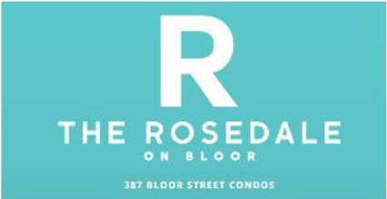
COMING SOON 387 Bloor St Condos is a new condo project by Easton’s Group of Hotels at 387 Bloor St East in Toronto.