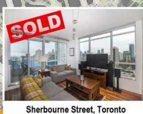
Sherbourne Street, Toronto