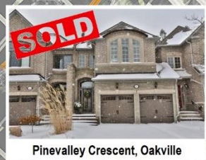
Pinevalley Crescent, Oakville