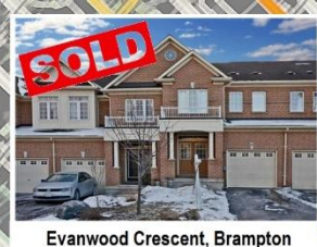
Evanwood Crescent, Brampton