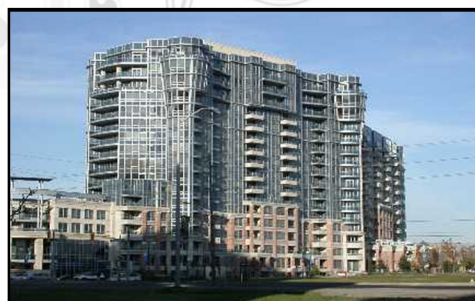
Warden/HWY 7 $399,800

Warden/HWY 7, Tridel CIRCA 2, 2 BR+den (3rd BR), Wood Floors. Southern Exposure With Unobstructed View Close To Schools, Transit, 407/404 and Shopping. 24-Hr Concierge. Incl Stainless Steel Kitchen Appliances, Washer & Dryer. State-Of-The-Art Amenities.