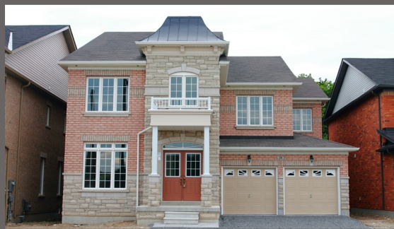
Brand New Luxury Home (3,863Sq.Ft) Premium Lot In High Demand Boxgrove Area, $$$ Upgrade, Hardwood Floors, Oak Stairs, Upgrade Handrail/Picket, Open To Above Foyer, Exterior Soffit Pot Lights, Alarm System $976,800