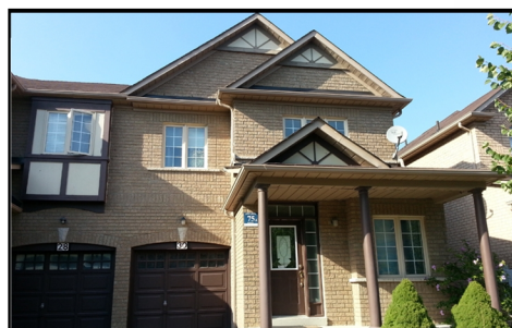
Woodbine/Major Mac $529,000

Spacious Detached Home In High Demand Community, 3+1 Bedroom, Finished Basement With Bedroom, Rec-room & 3pc Bath, 2nd Floor Family Room With Gas Fireplace, Main Floor Laundry, Steps To Donald Cousens P.S. with Childcare, Across Beautiful Park To Buroak S.S. YANG YANG, Sales Rep. (647)-501-6689