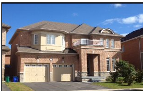
Markham/Major Mac $599,900