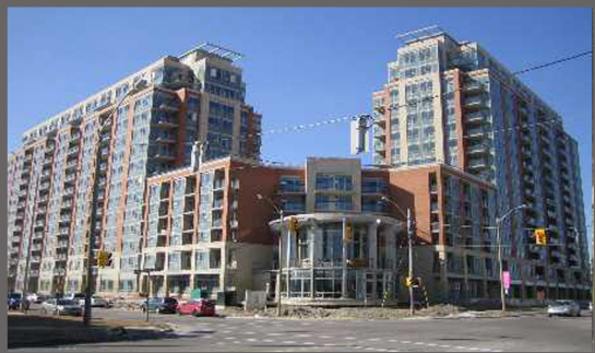
Warden/HWY 7 1 Bed w/Semi Ensuite Open Kitchen w/Centre Island Granite Countertop, Hardwood Fl.Parking and Locker $270,000