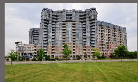
Warden/Hwy7 - Luxurious Tridel Condo with 5 stars amenities,Modern & spacious,1100+sq ft:2+1 bdrms,2 baths & 1 Parking w/ stunning South view fm the 16th fl.Within top ranked school zone: UHS, Coledale & St Justin. $469,900