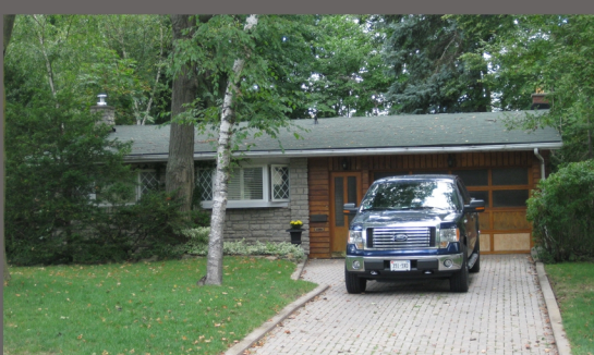
Don Mills/York Mills, 15 Mins Drive to Downtown Toronto, Large Pie-Shaped Lot Back to Ravine, Finished Walk-Out Basement, Walk-Out to Big Deck From Dining Room, Enjoy Your Backyard Oasis in the Heart of City, Near Shops, Parks, Trails, Schools $749,900