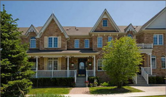
Kennedy/Major Mac, 3 Bedroom Townhouse, Master Bedroom 4 pc Ensuite, Open Concept Kitchen, Family Room with Gas Fireplace, Double Garage, Professionally Finished Basement, 2 piece washroom $539,000