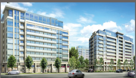
Luxury "Royal Gardens" at Prime HWY 7 Location. High Floors, From 600 to 680 sq ft, Open Concept & Fully Upgraded. Close To Shopping, Restaurants, YRT Transit. Parking & Locker included, Occupancy Summer 2013. $278,000