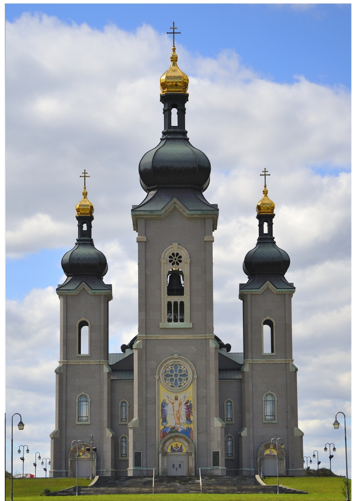
The Cathedral of the Transfiguration

Among its features is the world's largest three bell carillon, with the French made bells by the Fonderie Paccard, weighing 32,000 pounds, and 300 cm diameter. The mosaics are reputed to contain about 5 million pieces. The cathedral was built to hold 1,200 people. The central tower rises 63 meters (about 20 storeys) and is topped by a gold onion dome. The church was designed by Donald Buttress, a renowned British architect whose claim to fame is overhauling Westminster Abbey.