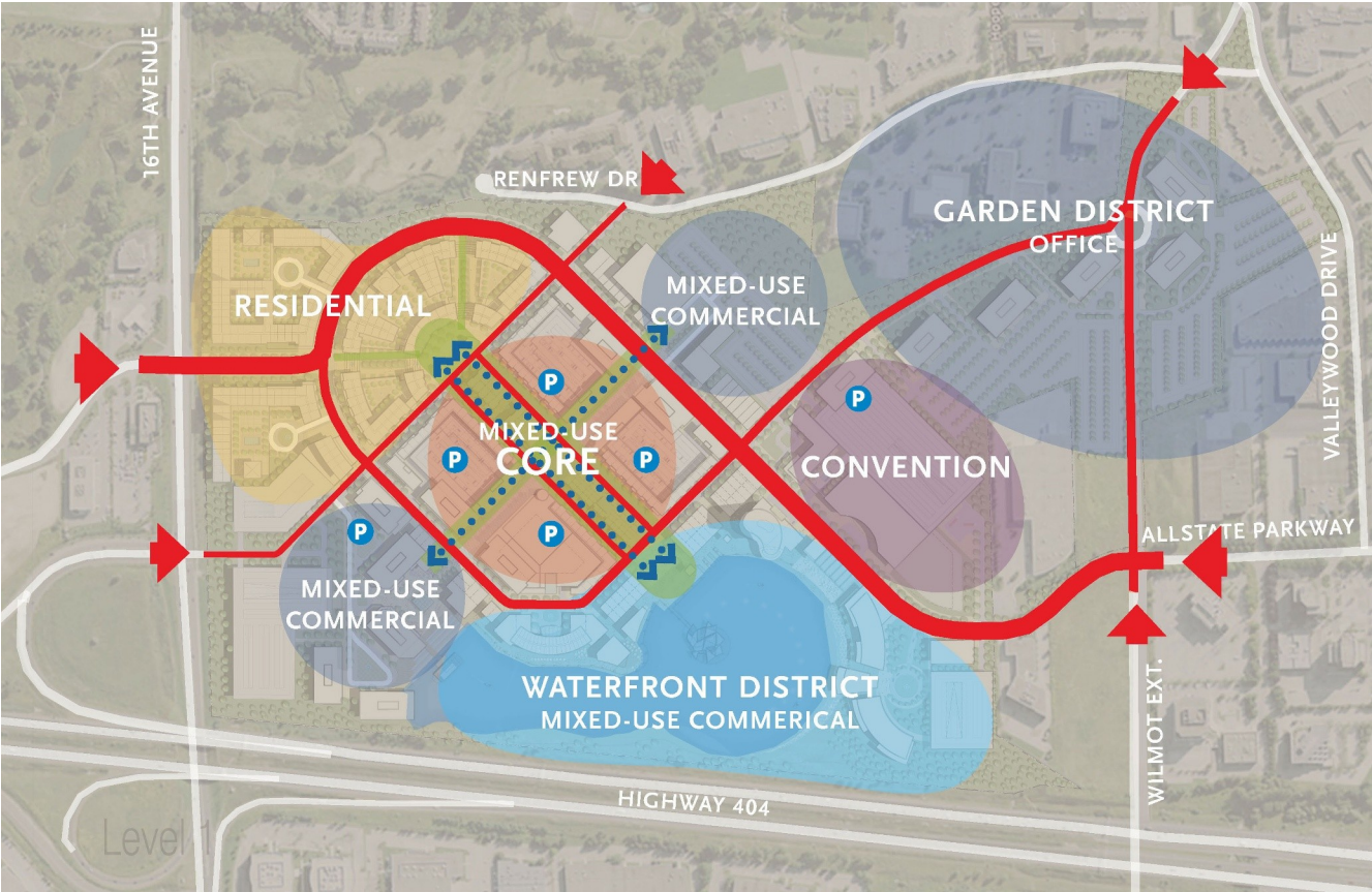
3 - Proposed development plan for Buttonville Airport displaying the various sectors

Homeowners interested in moving to Markham – or who want to stay posted on the latest real estate developments in the Buttonville Area as they become available – can connect with Living Realty’s team of Markham real estate experts by visiting us online at http://www.livingrealty.com . For up-to-the-date information on this and many other great construction initiatives around the GTA, check out our GTA Real Estate News web site at http://news.livingrealty.com .