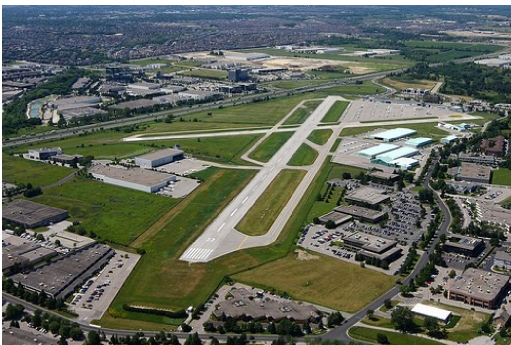
1 - Aerial view of the present day Buttonville Airport

The job creation aspect was important to local government at both the municipal and regional levels, who wanted the new development to be in line with their focus on nurturing knowledge-based industries.